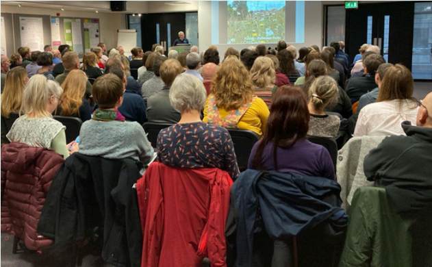
Pollinator's event at the James Hutton Institute