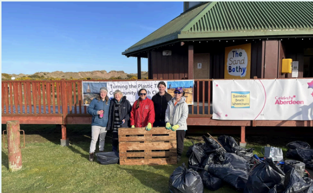
Beach Clean by EGCP - Turning the Plastic Tide, The Sand Bothy and volunteers