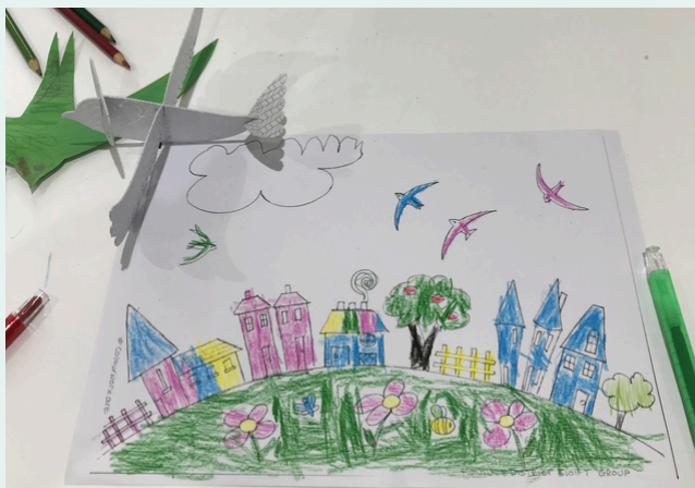
'A Swift's Tale' at Orbs Community Bookshop by Huntly Swift Group - NES Swifts