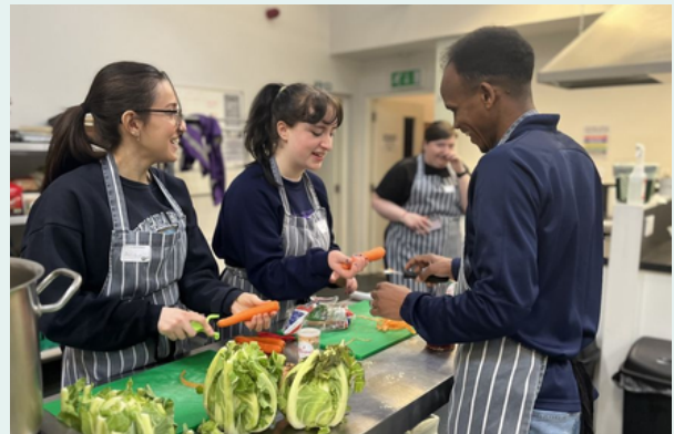
Zero Waste Cooking Day by CFINE in partnership with Granite City Good Food