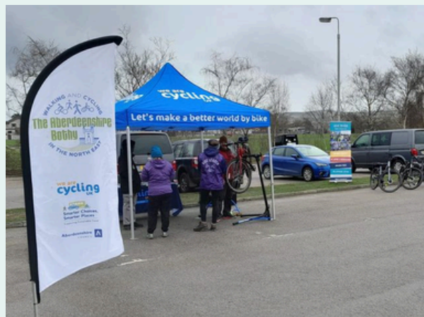
Bike Repairs, e-bikes set up at Garioch Sports Centre