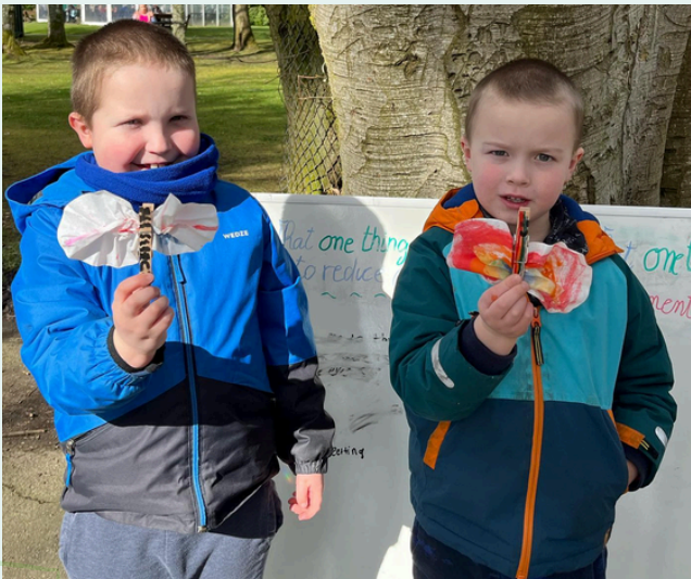
Butterfly Game at Green Family Day, Hazlehead Park