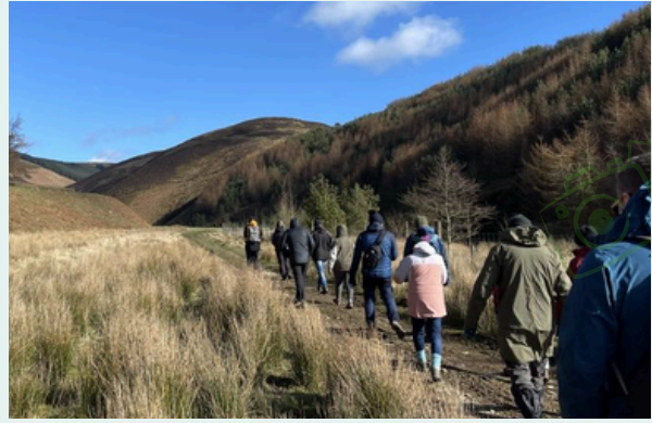
Climate Positive Farming - Taste Day at JHI, Glensaugh