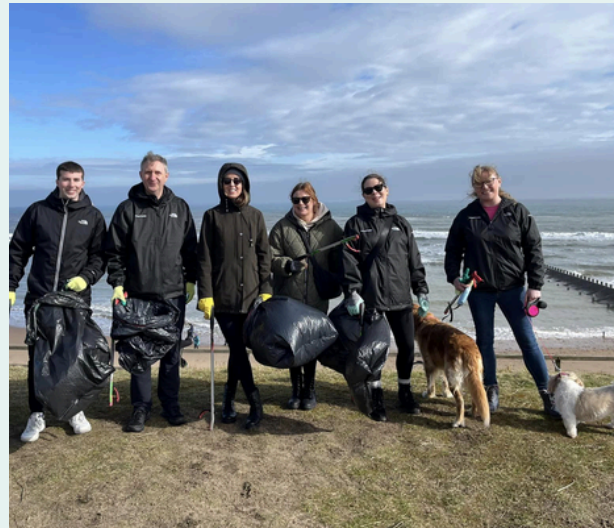
Aberdeen Beach Clean with Marine Conversation Society and EGCP - Turning the Plastic Tide