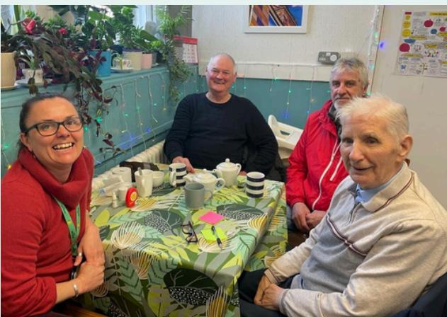
NESCAN Hub Community Development Officers Session at The Living Room, Stonehaven