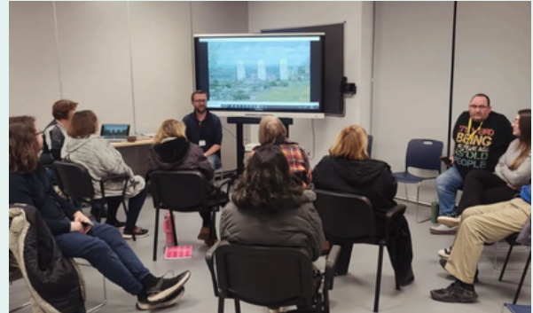
Torry Community Members watch Rooted Community TV Documentary and The Cost of Warmth – SHMU