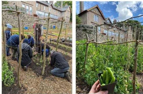
What a difference a month makes!