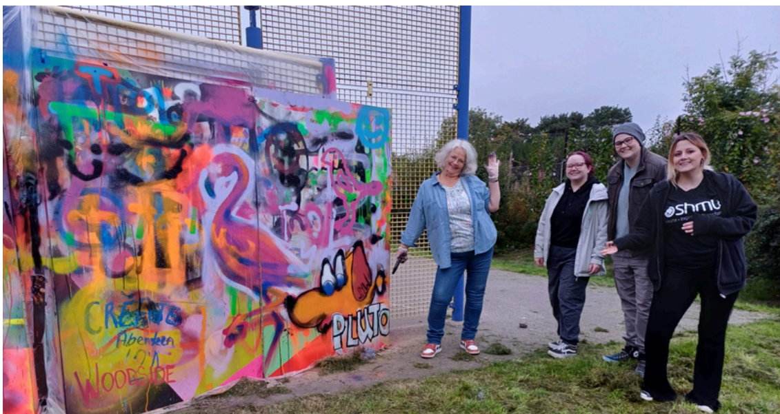
shmuFEST on 22nd September